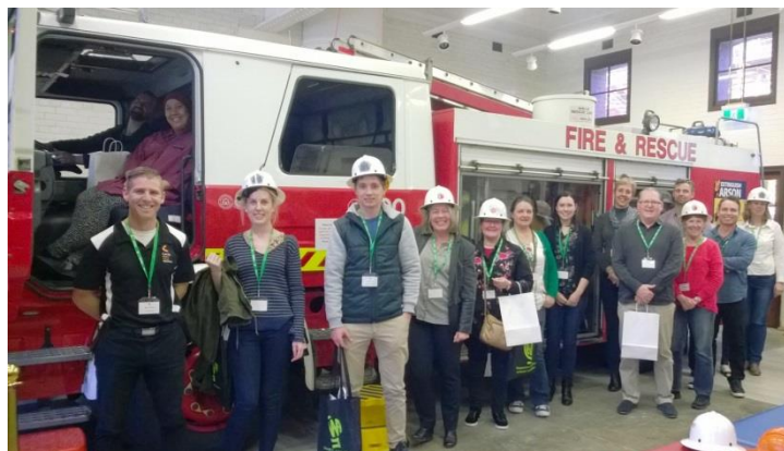
Geography teachers at an Education & Heritage Centre PD

This year the DFES School Aged Education team has developed a strategy to implement teacher professional development for school teachers across the state.