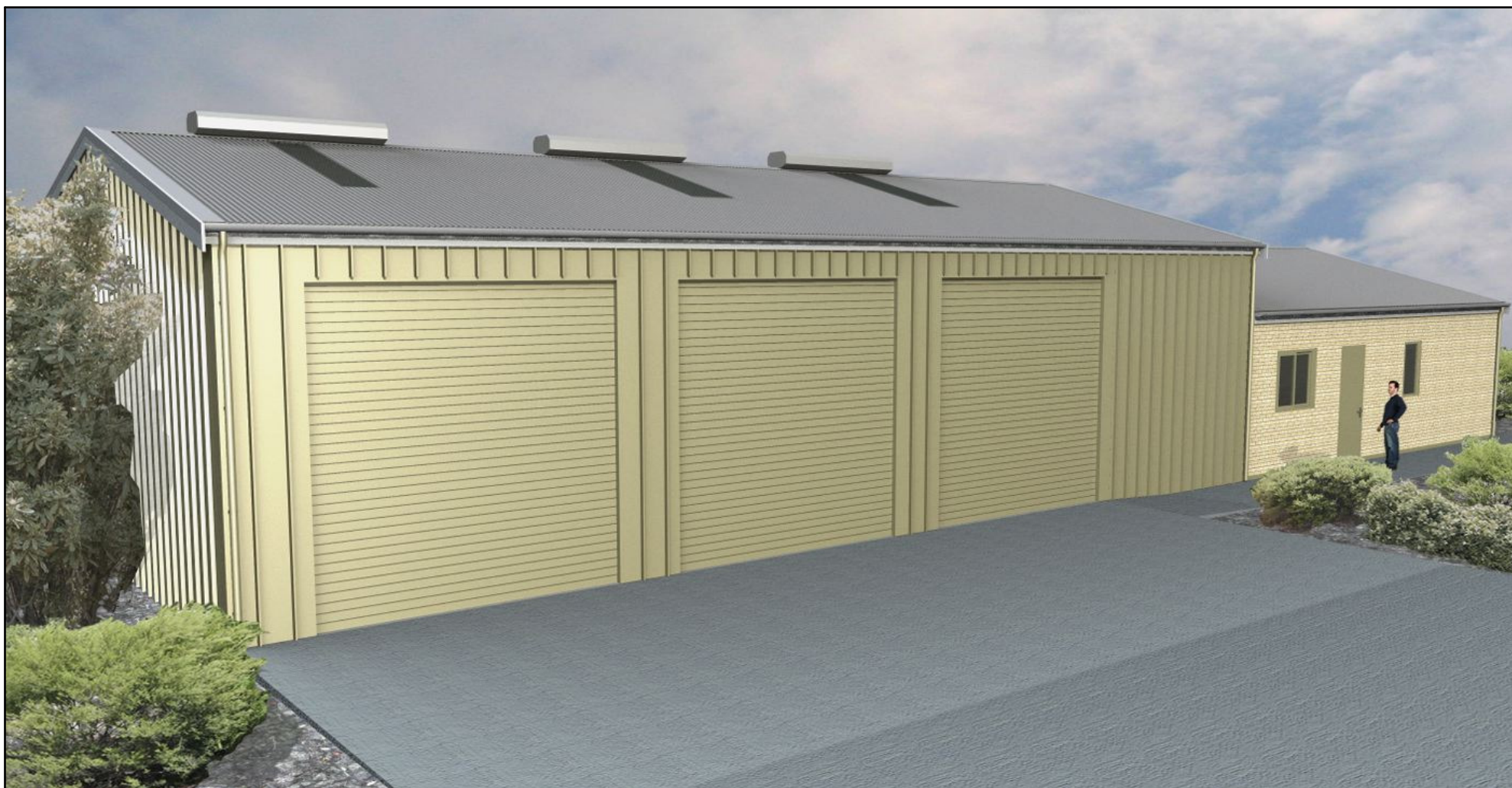
INDICATIVE BRICK OPTION

STATE EMERGENCY SERVICE FACILITY WITH AMENITIES SUITABLE FOR SES UNIT WITH UP TO 40 ACTIVE MEMBERS